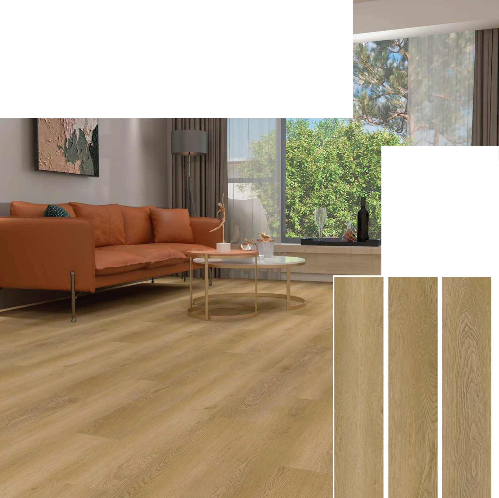
EC643 Predator Ridge