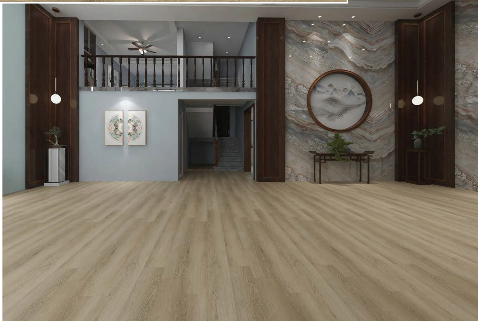
EC644 Stewart Creek