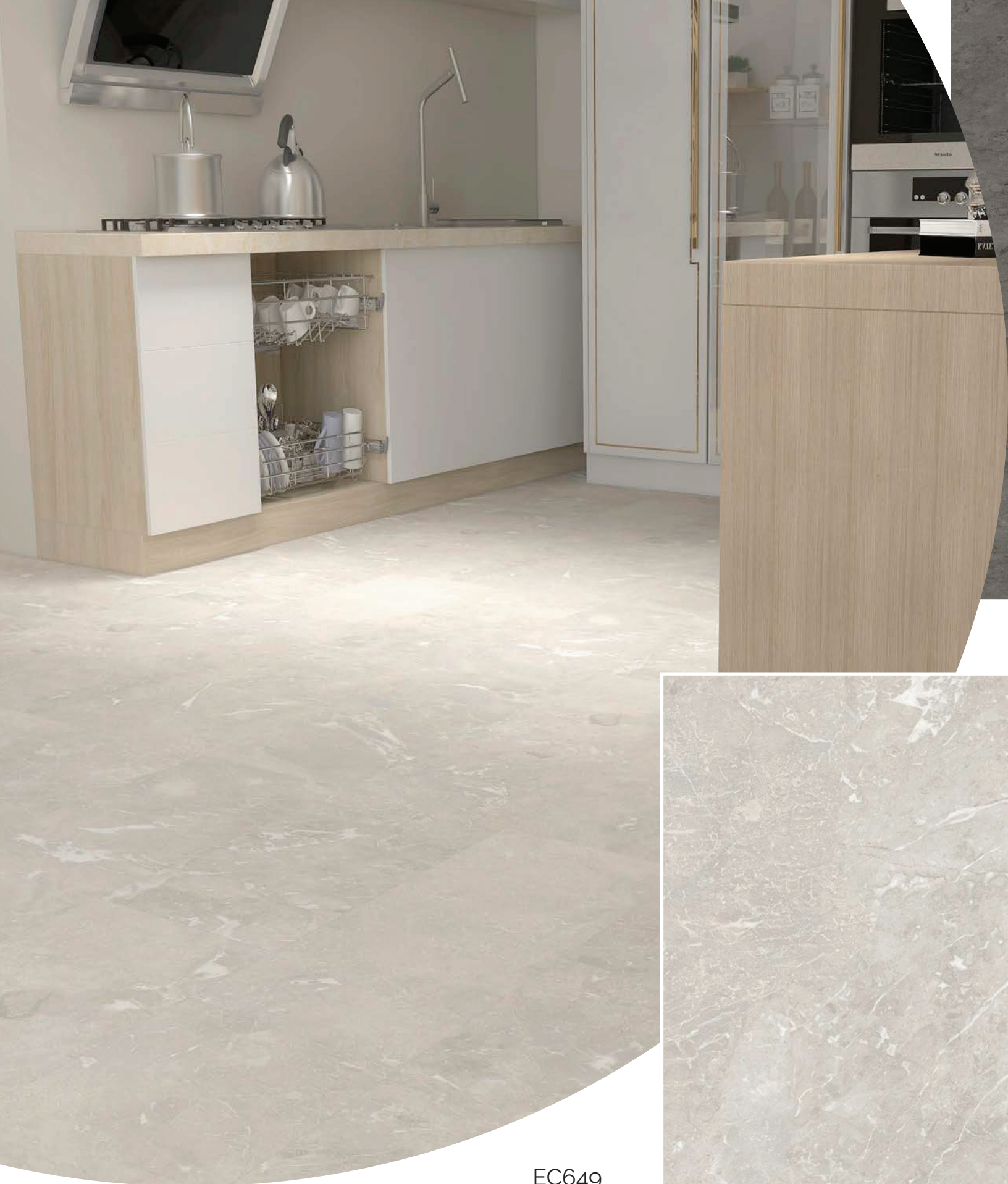
EC649 Copper Point