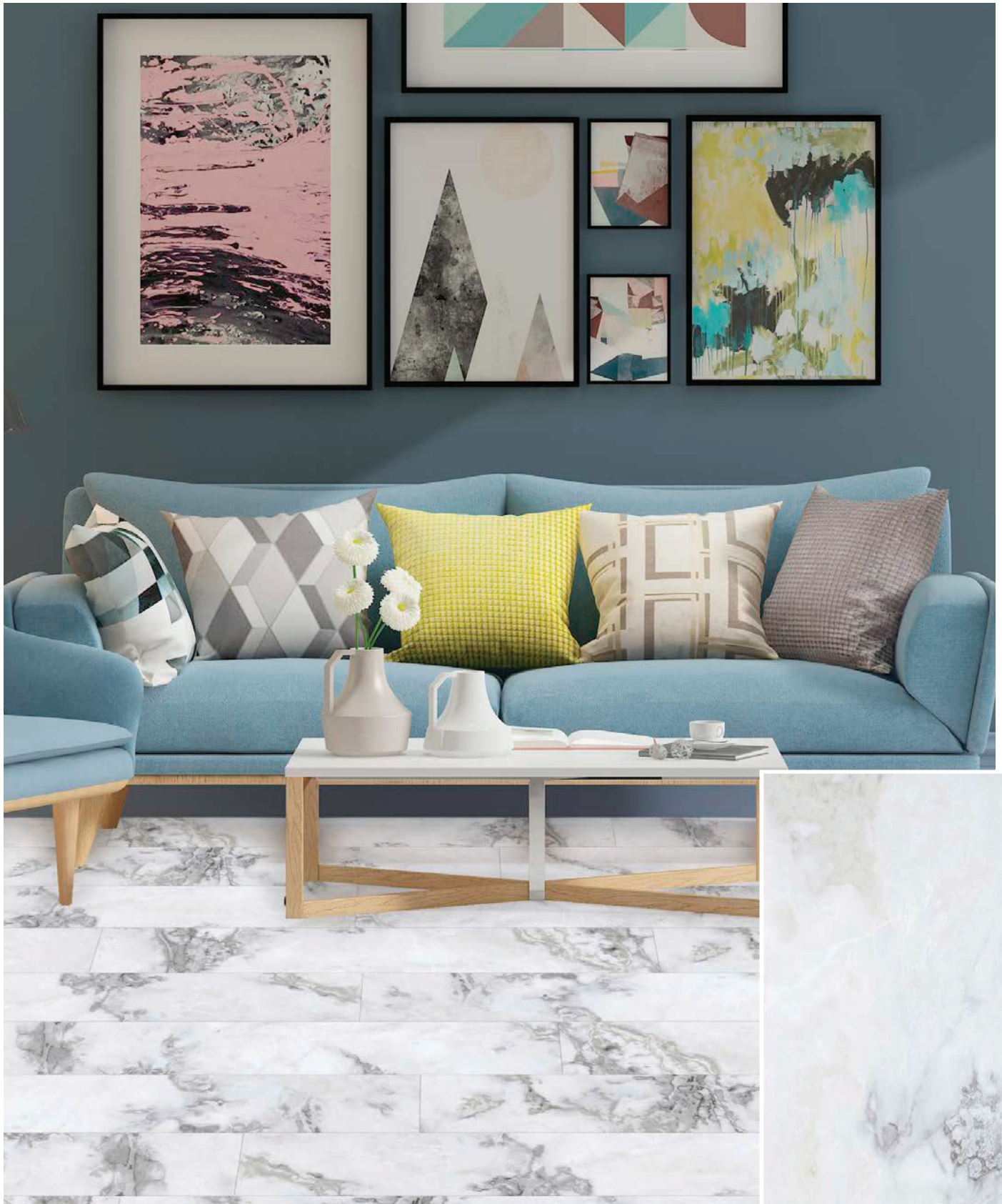
EC648 Crystal Ridge